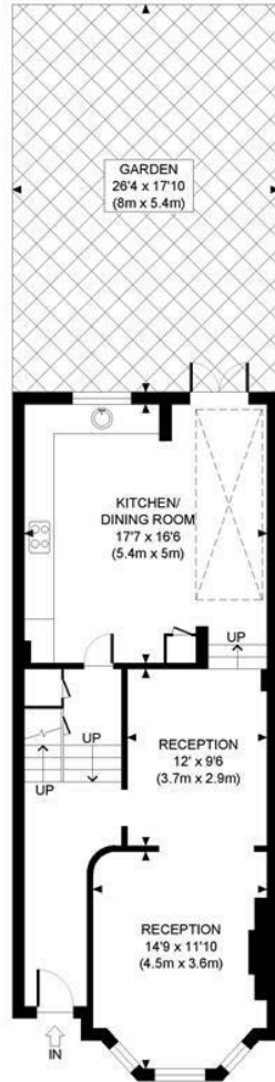
GROUND FLOOR GROSS INTERNAL FLOOR AREA 713 SQ FT