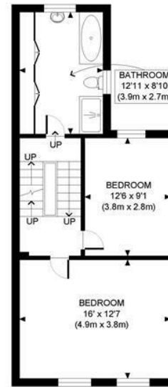
SECOND FLOOR GROSS INTERNAL FLOOR AREA 526 SQ FT

APPROX. GROSS INTERNAL FLOOR AREA WITH EAVES STORAGE: 2123 SQ FT/ 197 SQM APPROX. GROSS INTERNAL FLOOR AREA WITHOUT EAVES STORAGE: 2042 SQ FT/ 190 SQM